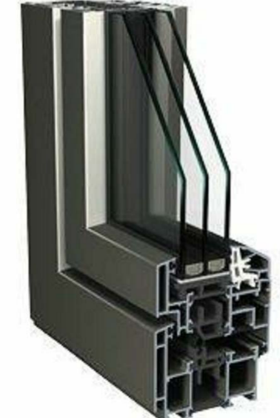
Aluminium windows. RAL to be confirmed