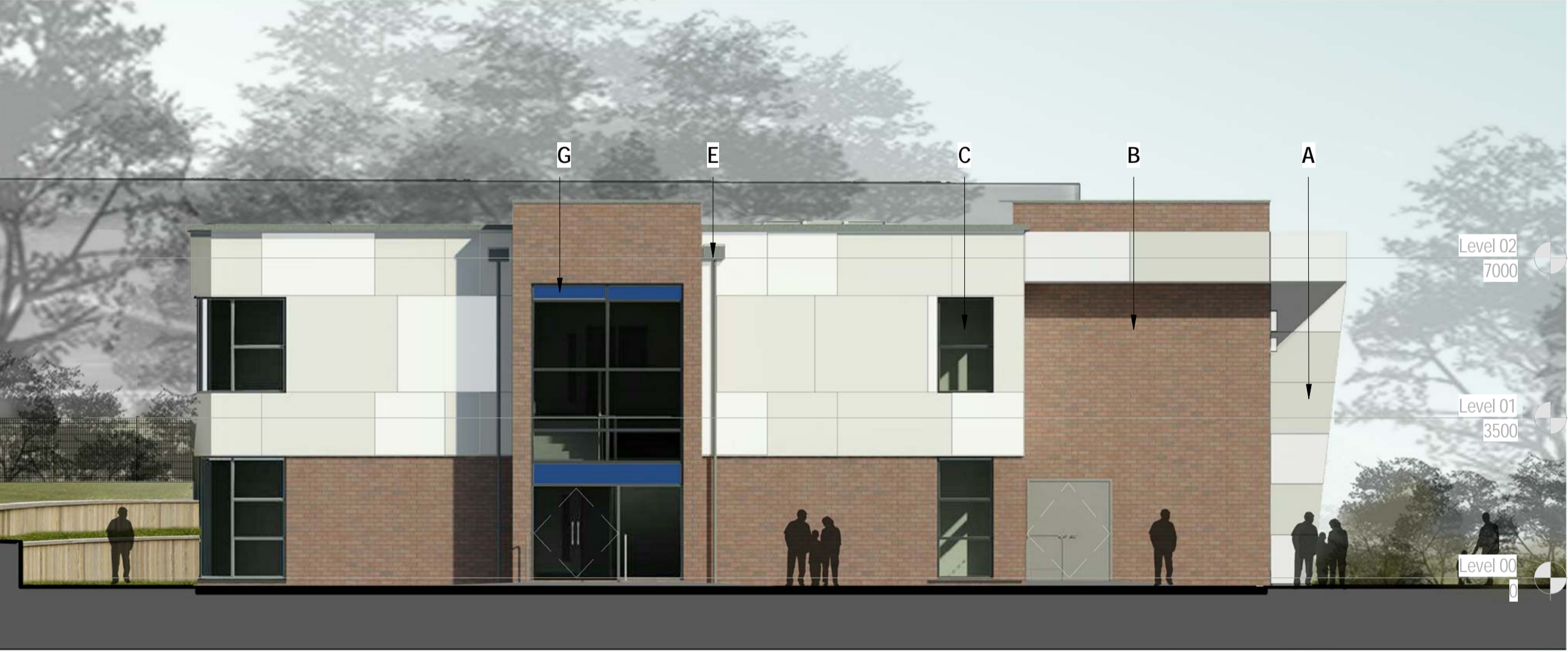
3 South Elevation 1 : 100