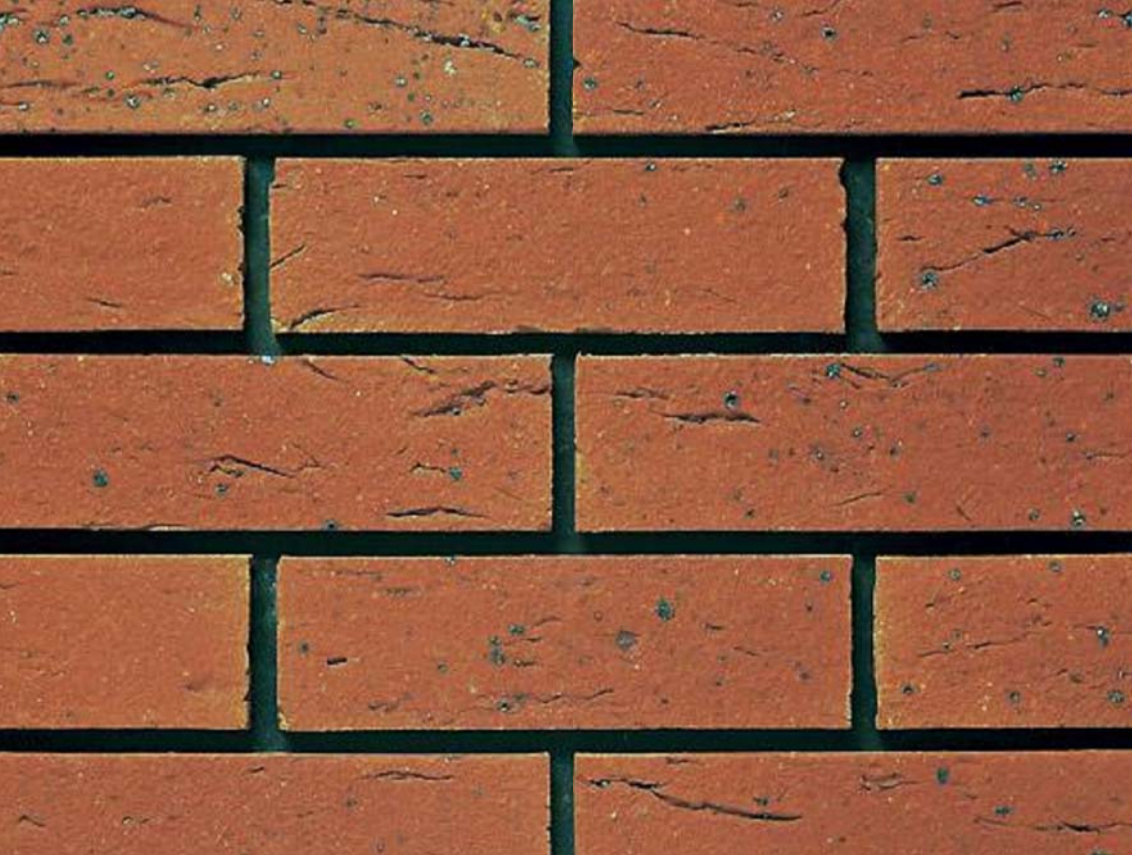
Red Brick, Manufacturer TBC