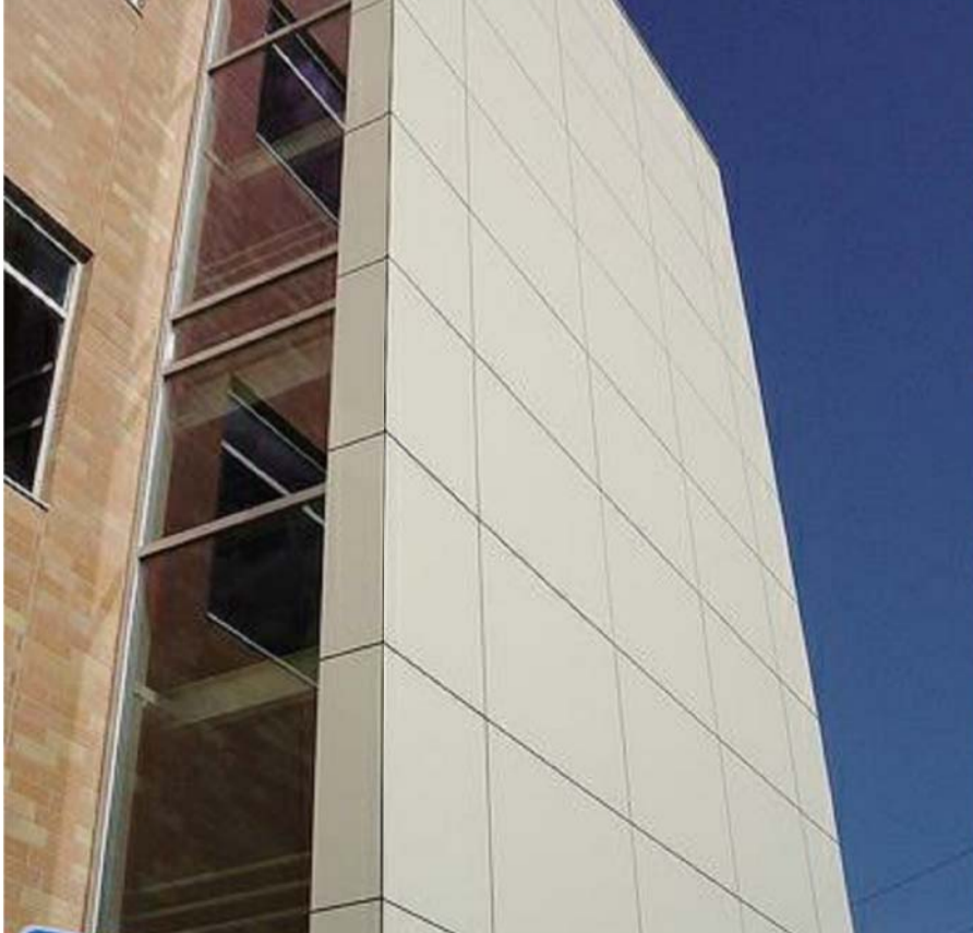
Rainscreen Cladding - Trespa Miteon, multi white.