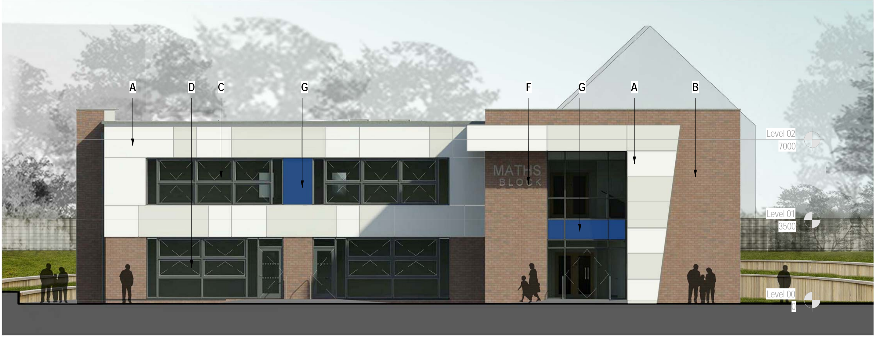
2 East Elevation 1 : 100