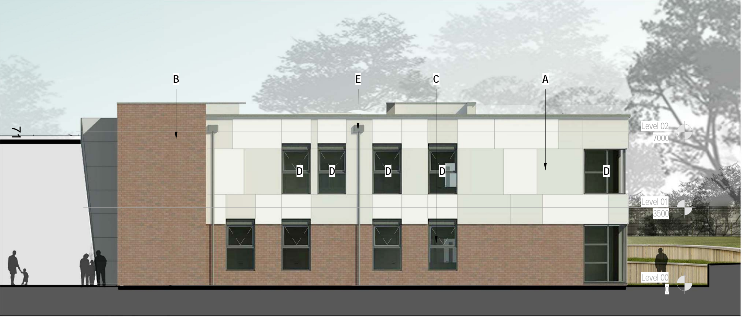
1 North Elevation 1 : 100