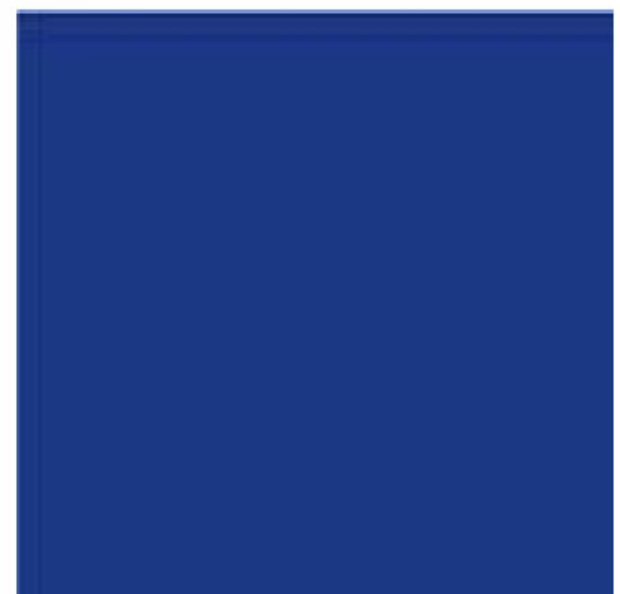
Window Infill Panels. RAL to be confirmed