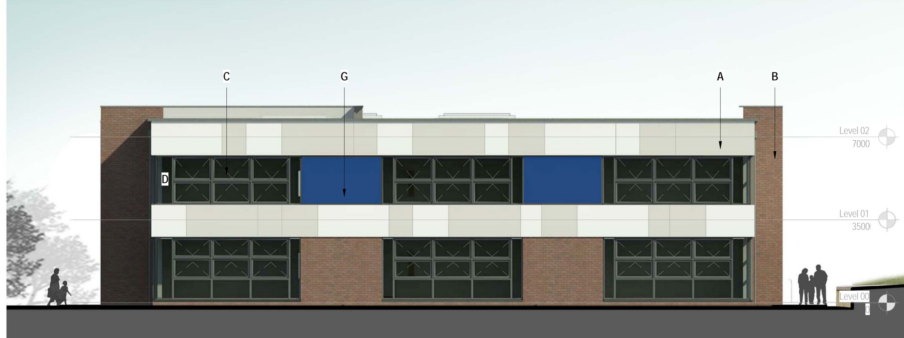
4 West Elevation 1 : 100