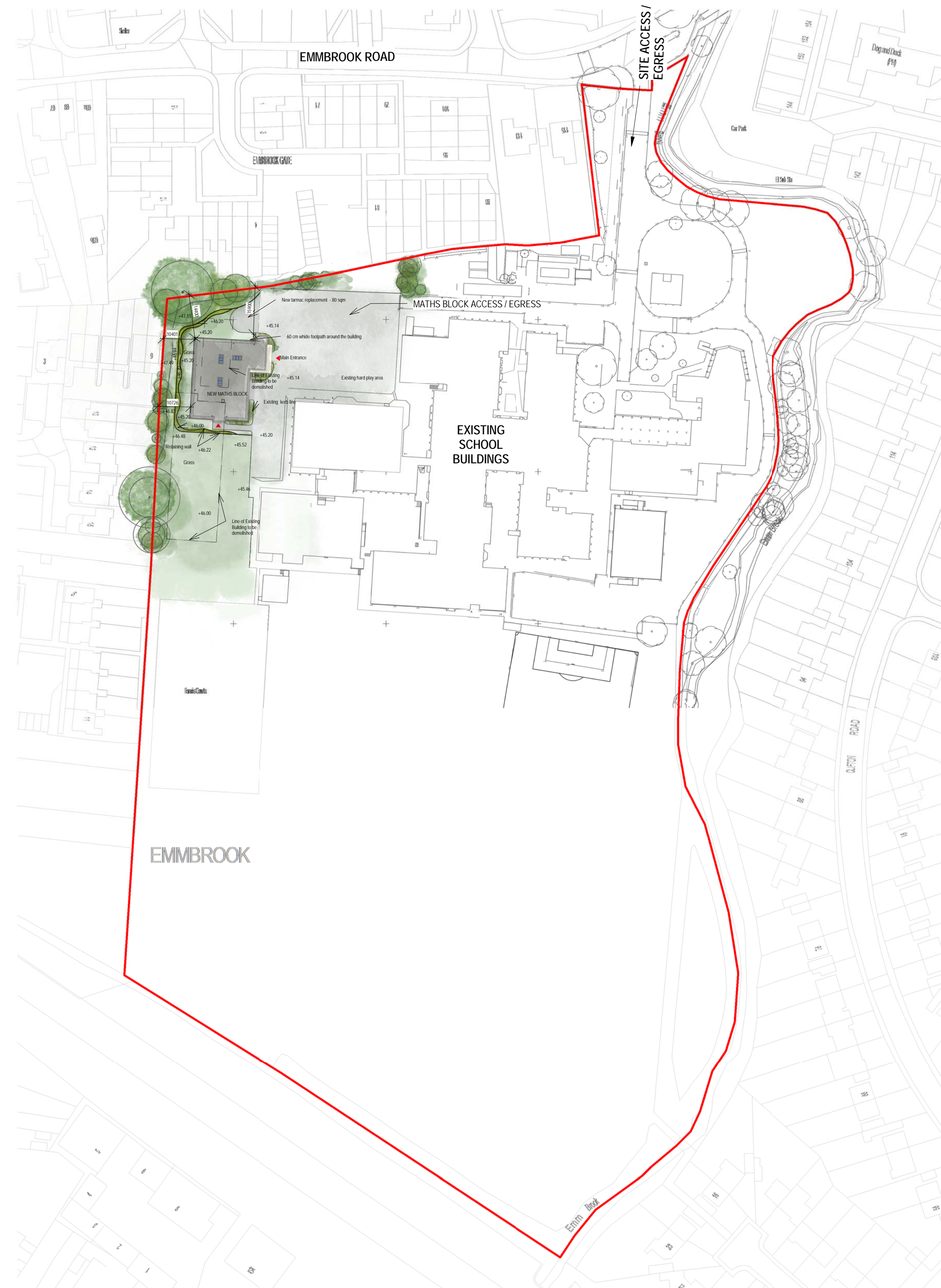
1 Site Plan 1 : 1000