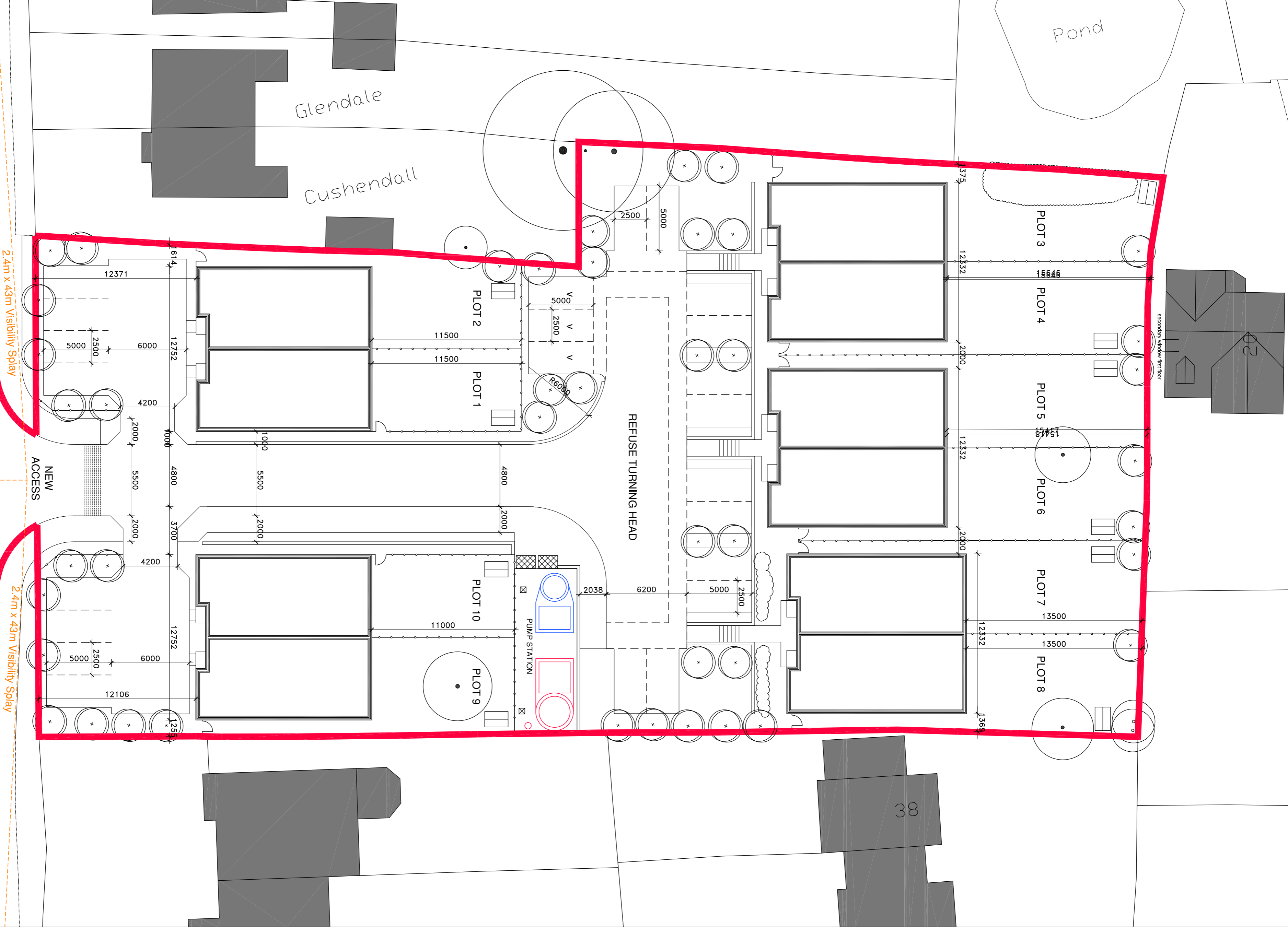
DIMENSION PLAN (Scale: 1:200)

NOTE THIS DRAWING IS THE COPYRIGHT OF AMASIA ARCHITECTS LTD AND MAY NOT BE COPIED, ALTERED OR REPRODUCED IN ANY FORM, OR PASSED TO A THIRD PARTY WITHOUT THE WRITTEN CONSENT OF AMASIA ARCHITECTS LTD. DIMENSIONS SHOULD BE CHECKED AND VERIFIED ON SITE AND ANY DISCREPANCIES SHOULD BE REPORTED TO THE ARCHITECT. USE FIGURED DIMENSIONS ONLY. IF IN DOUBT ASK FOR CONFIRMATION.