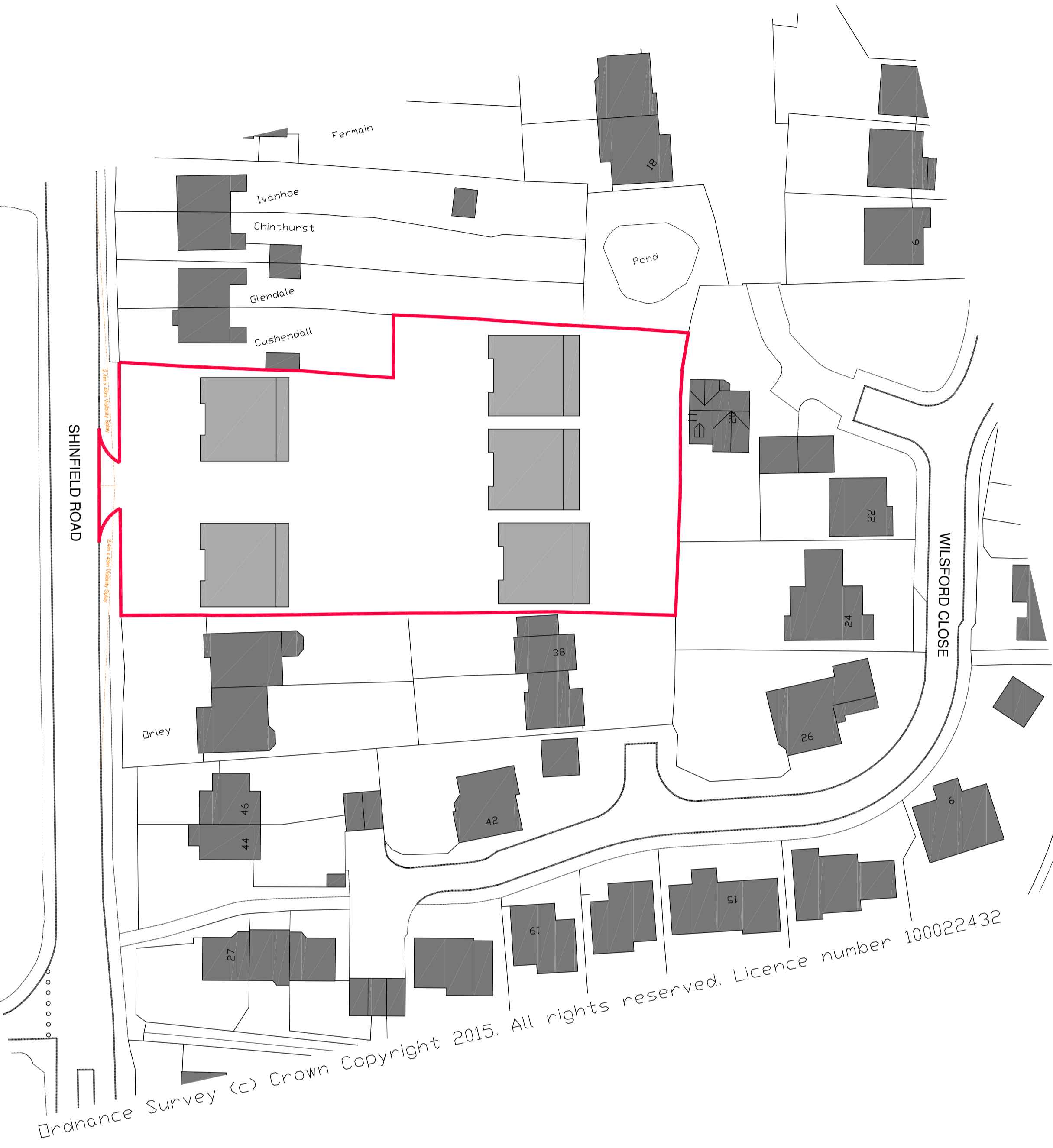
BLOCK PLAN (Scale: 1-500)