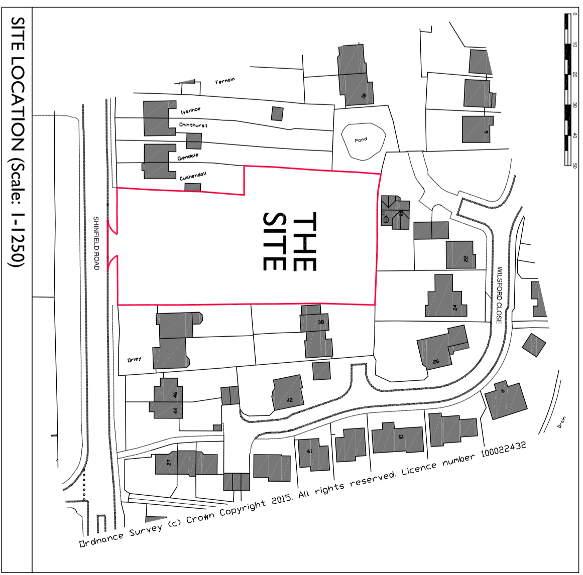
SITE LOCATION (Scale: 1-1250)

NOTE THIS DRAWING IS THE COPYRIGHT OF AMASIA ARCHITECTS LTD AND MAY NOT BE COPIED, ALTERED OR REPRODUCED IN ANY FORM, OR PASSED TO A THIRD PARTY WITHOUT THE WRITTEN CONSENT OF AMASIA ARCHITECTS LTD. DIMENSIONS SHOULD BE CHECKED AND VERIFIED ON SITE AND ANY DISCREPANCIES SHOULD BE REPORTED TO THE ARCHITECT. USE FIGURED DIMENSIONS ONLY. IF IN DOUBT ASK FOR CONFIRMATION.