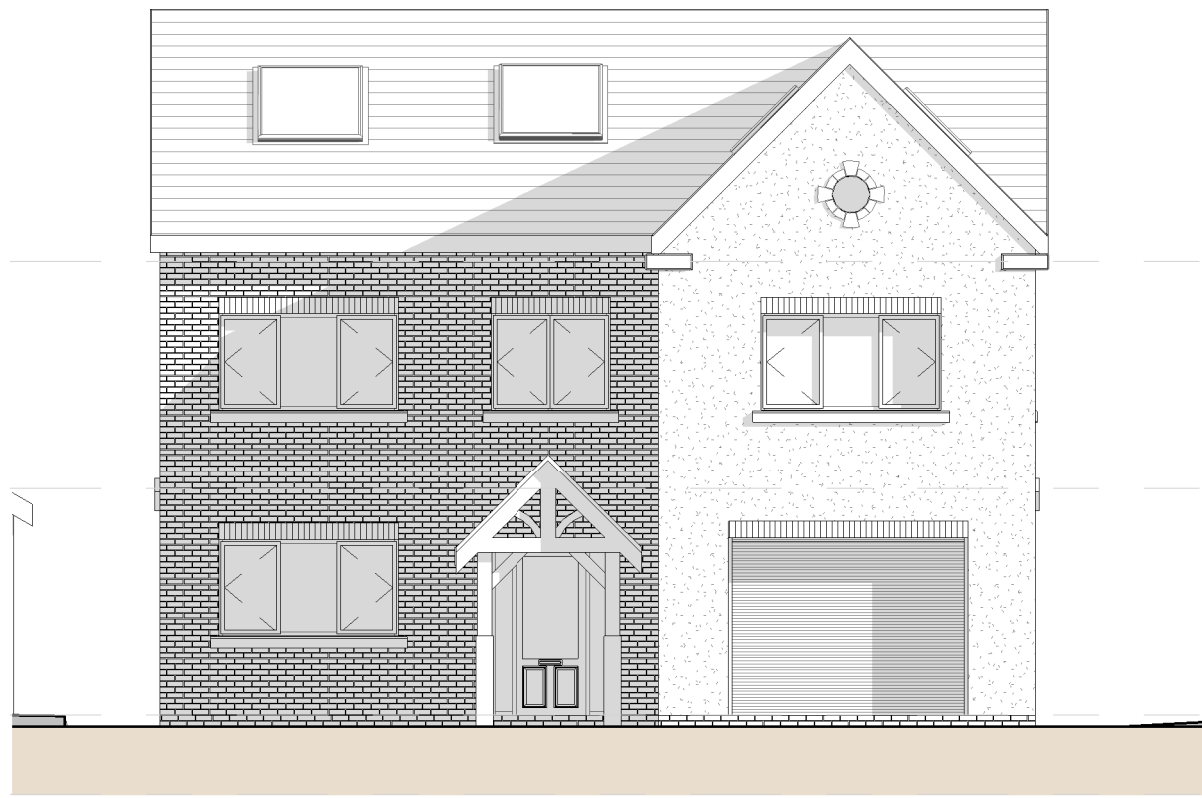
Proposed Principal Elevation 1:100