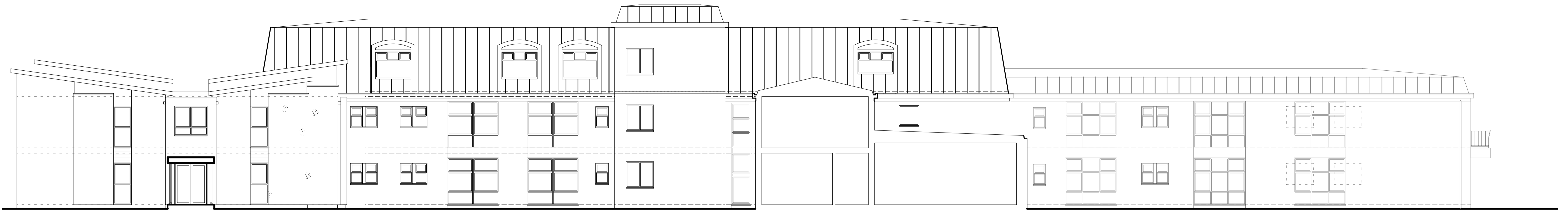
PROPOSED WEST ELEVATION (INCORPORATING ELEVATION OF EXISTING BUILDING)