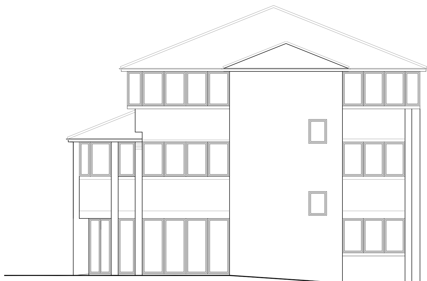
WEST ELEVATION. Proposed