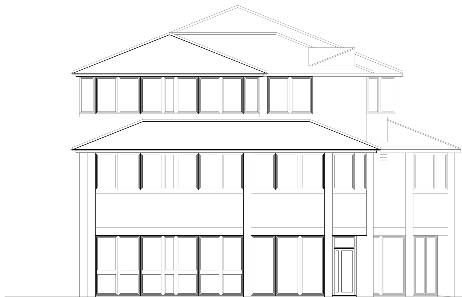
EAST ELEVATION. Proposed

Proposed new principal entrance doors to offices