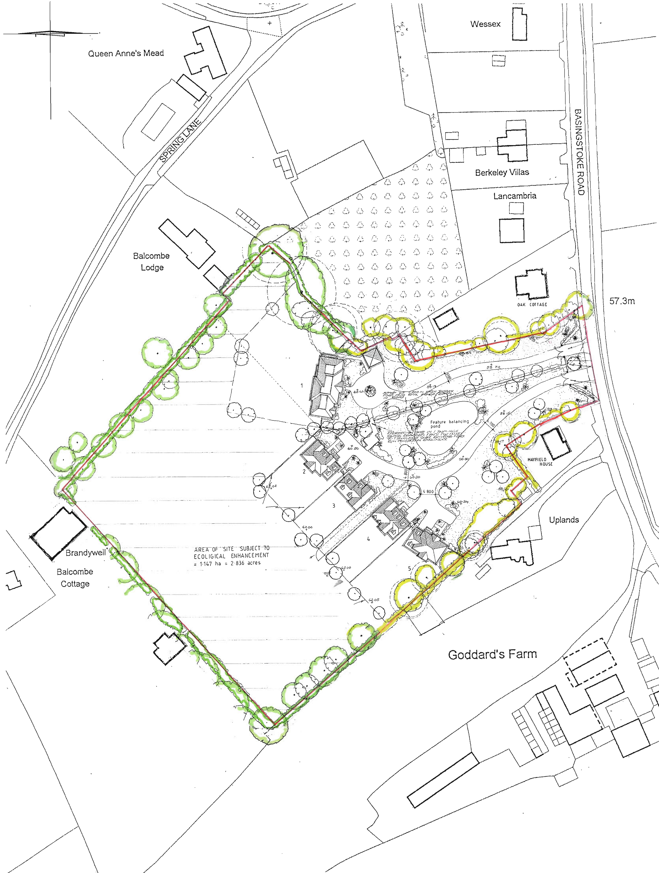
CONTEXT PLAN 1:1000