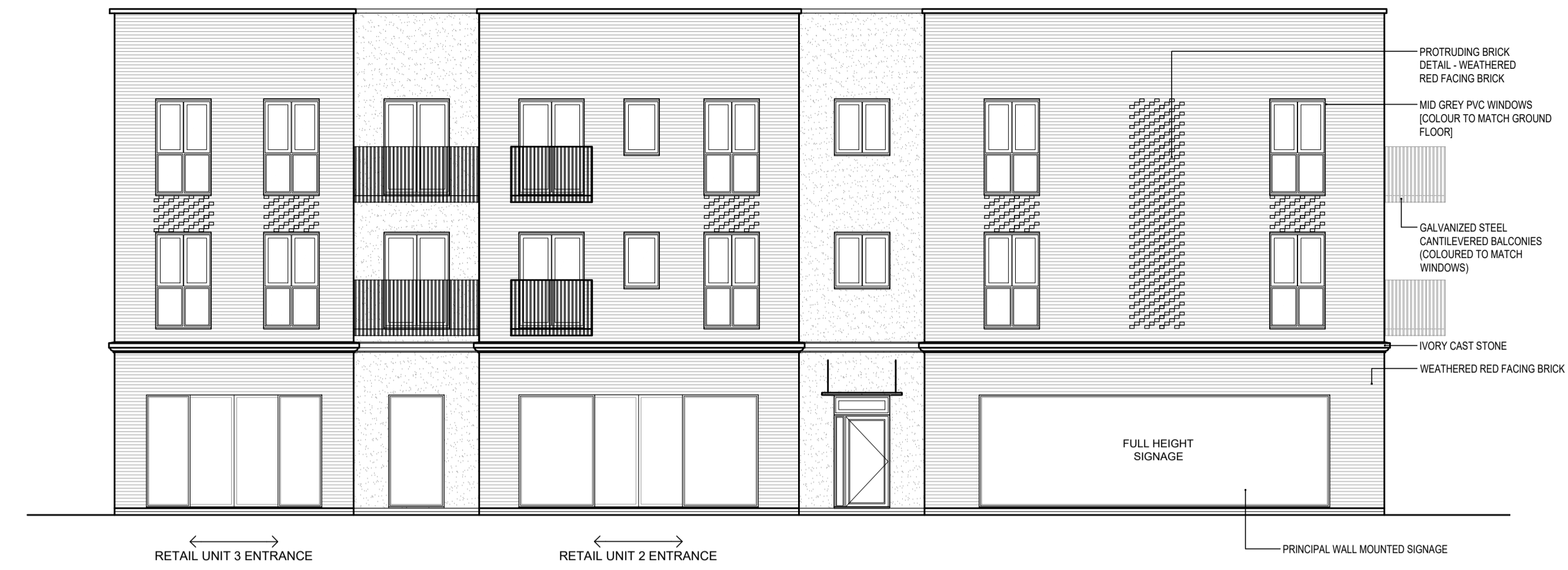
Side Elevation 1 (South)