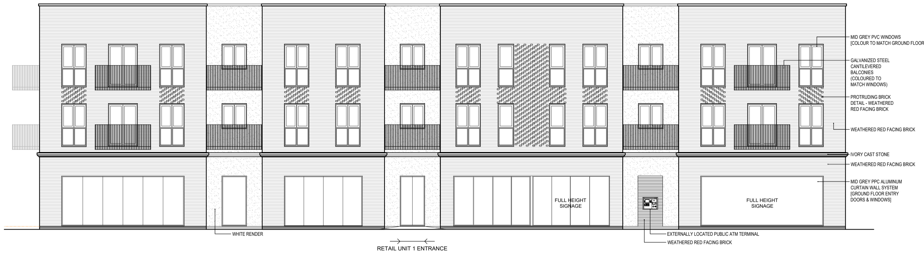
Front Elevation (East)