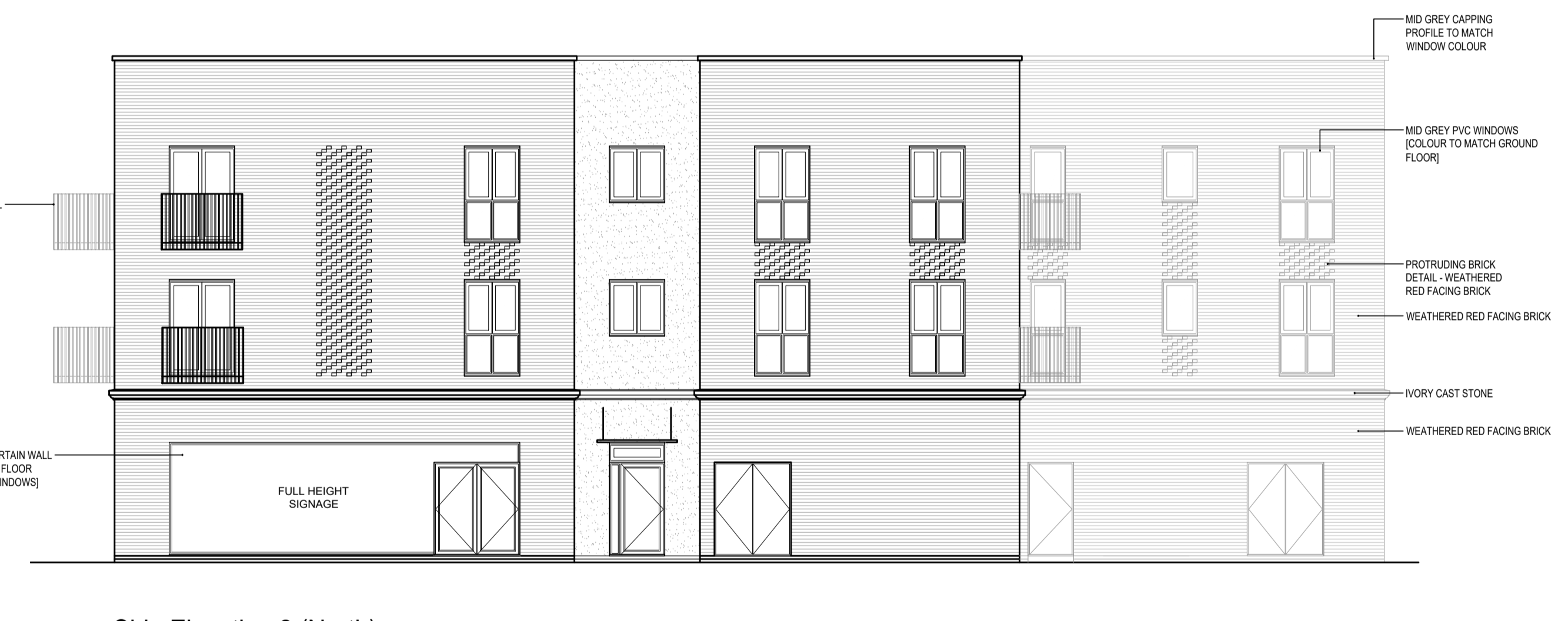
Side Elevation 2 (North)