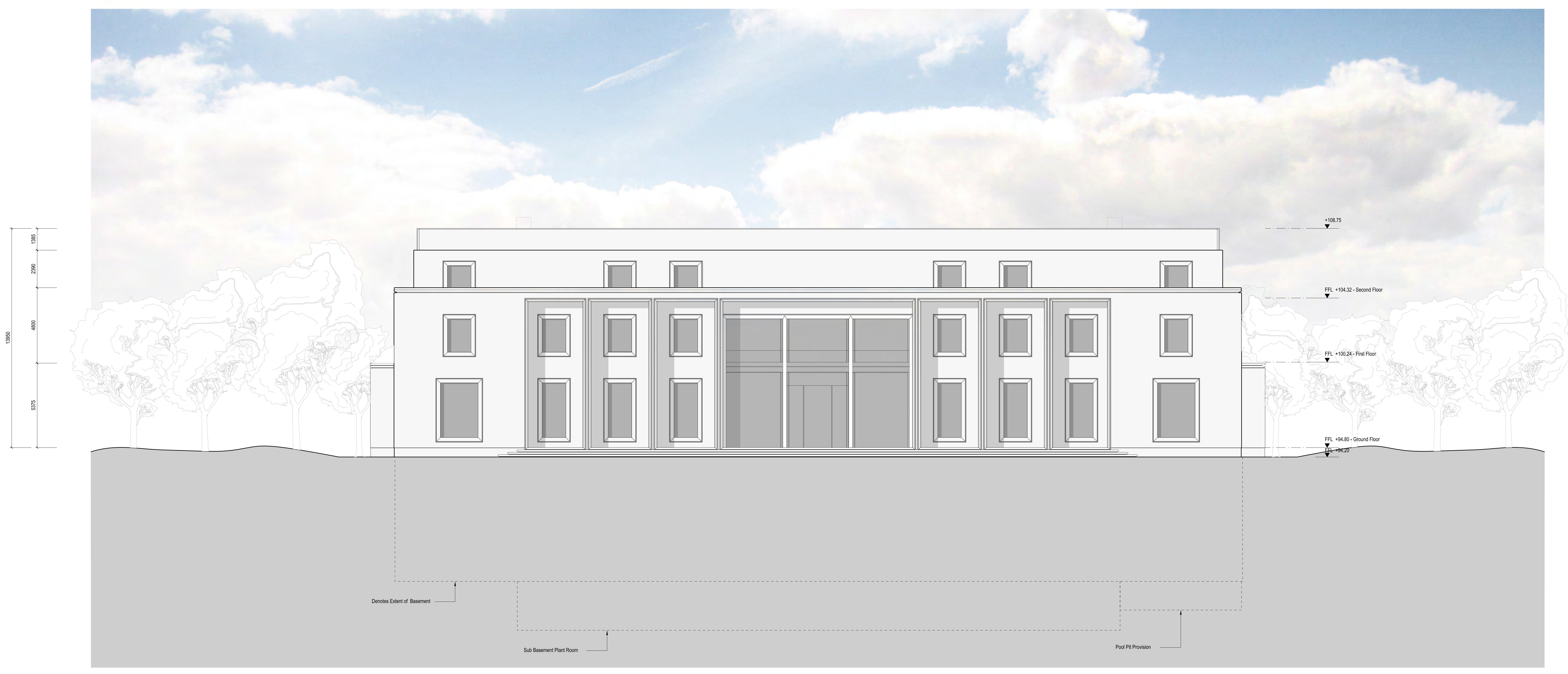
01 South Elevation 1:100