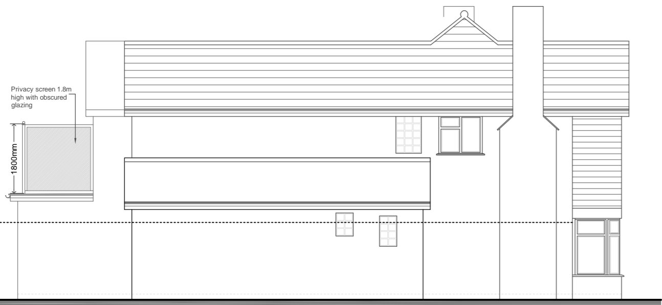
PROPOSED SIDE ELEVATION 01 SCALE 1:100