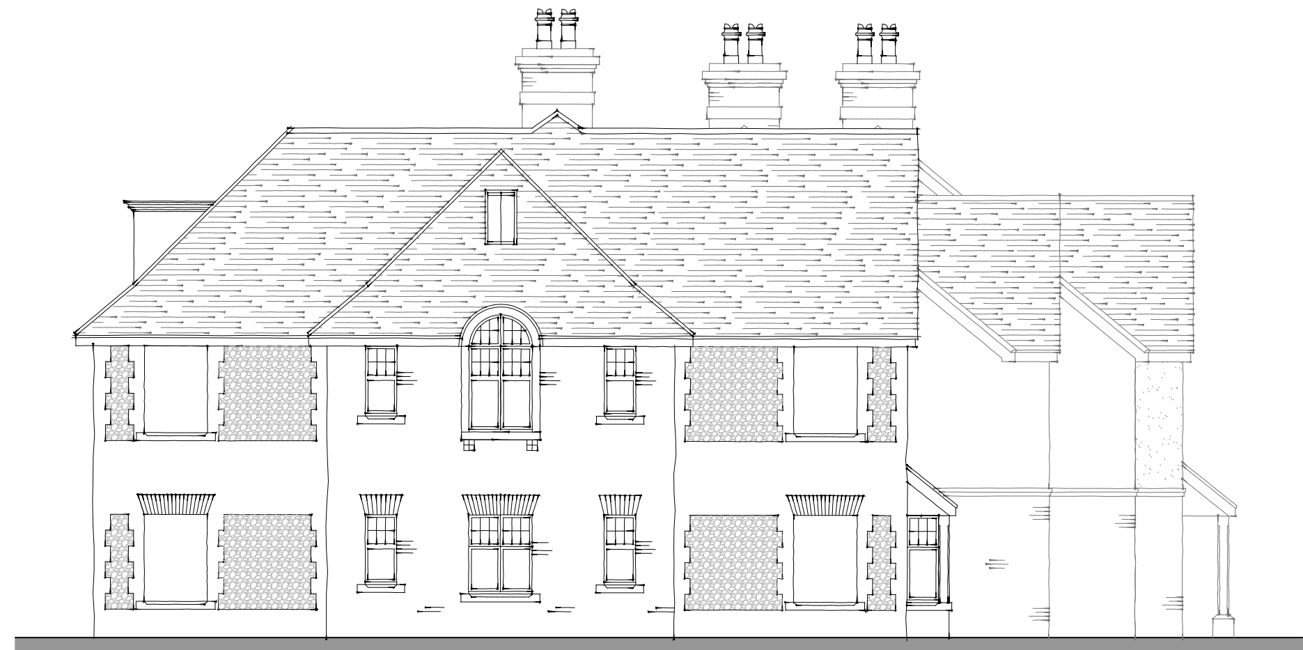
PROPOSED SIDE ELEVATION Plots 6 and 8