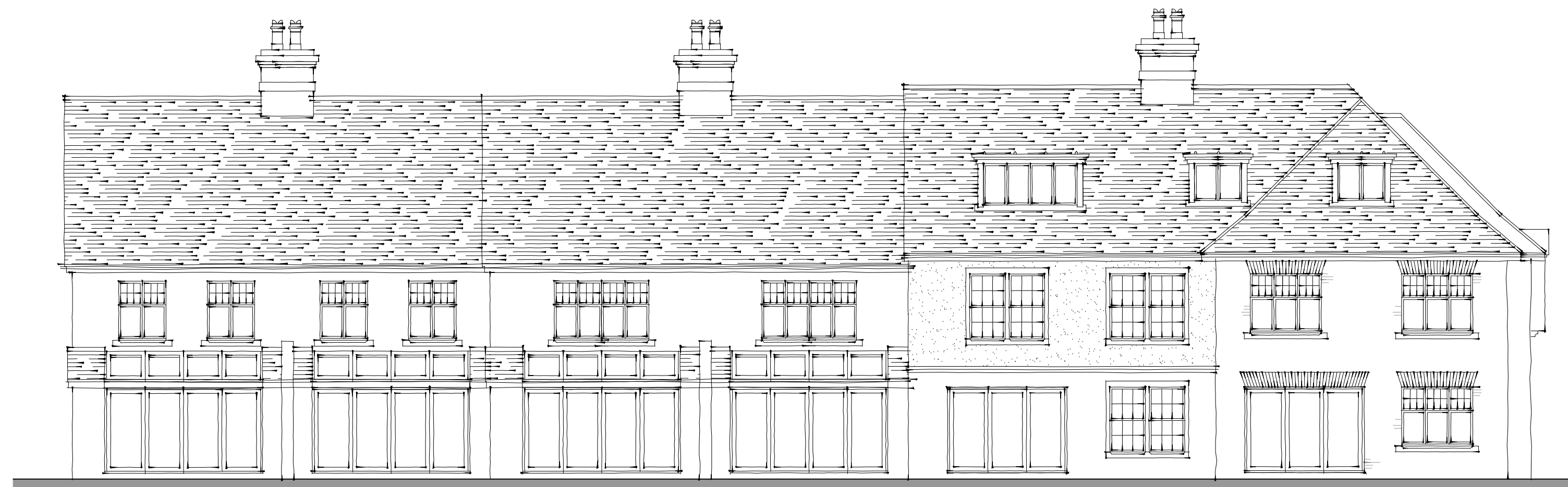
PROPOSED REAR ELEVATION plot 1