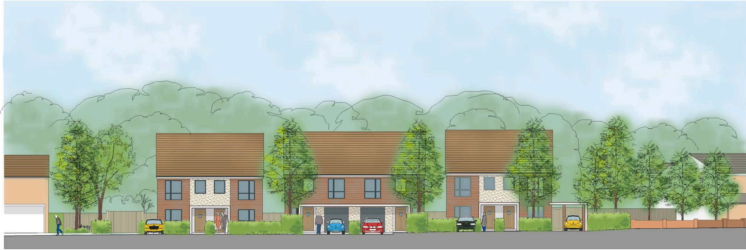
Finch Road Street Elevation Facing East