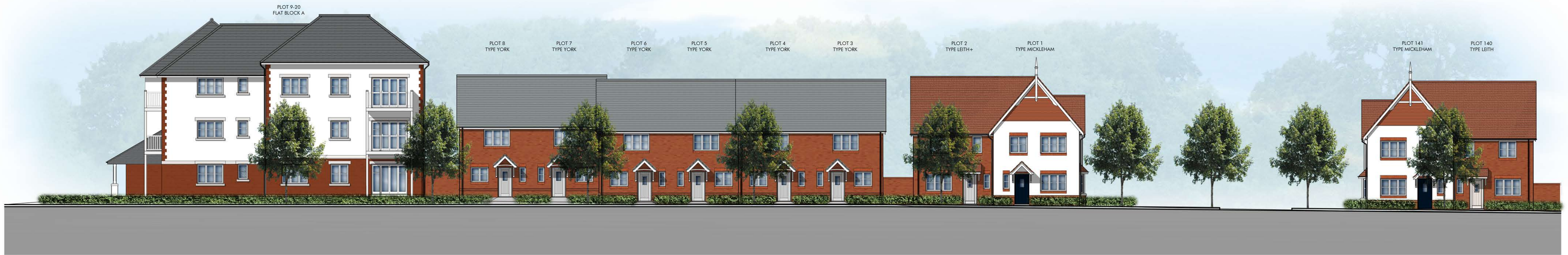
STREET ELEVATION - A