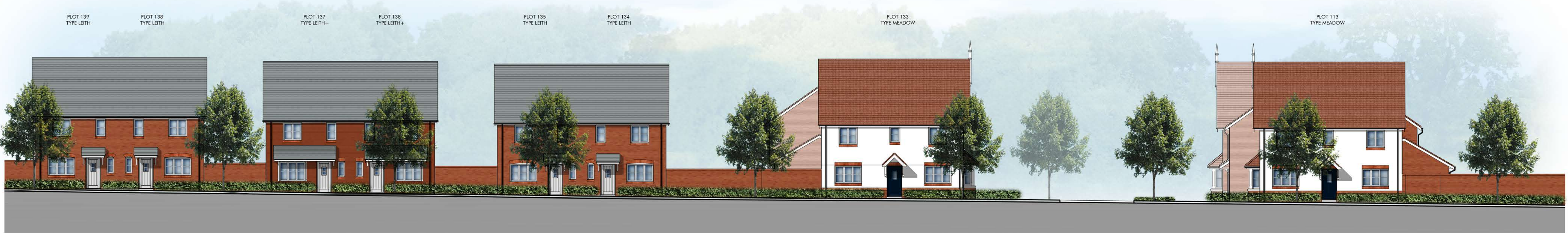
STREET ELEVATION - B