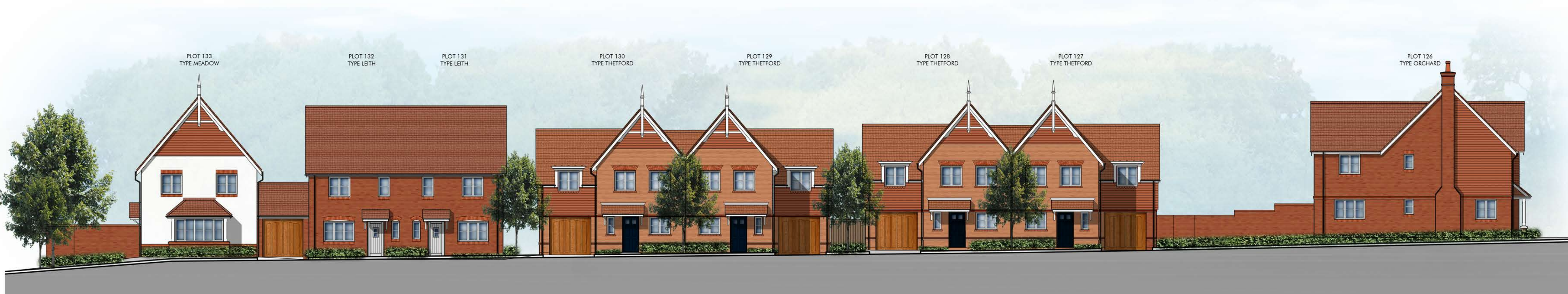
STREET ELEVATION - C