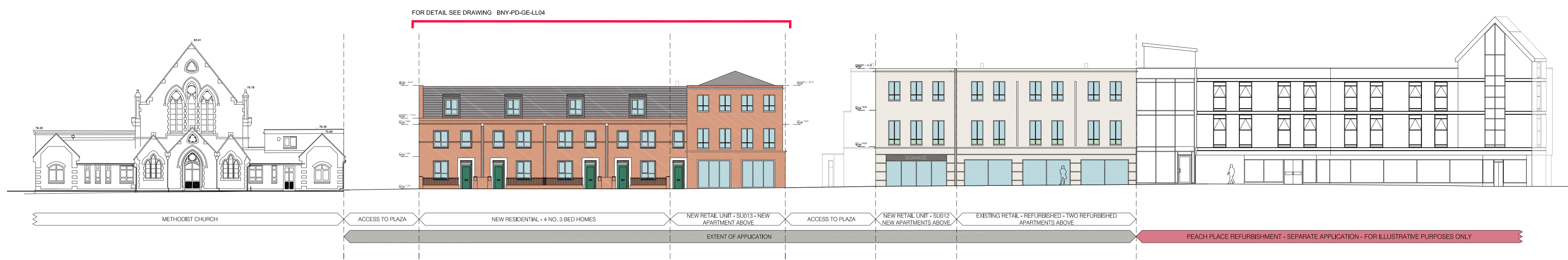
ELEVATION A-A, ROSE STREET [SCALE 1:200 @ A1]