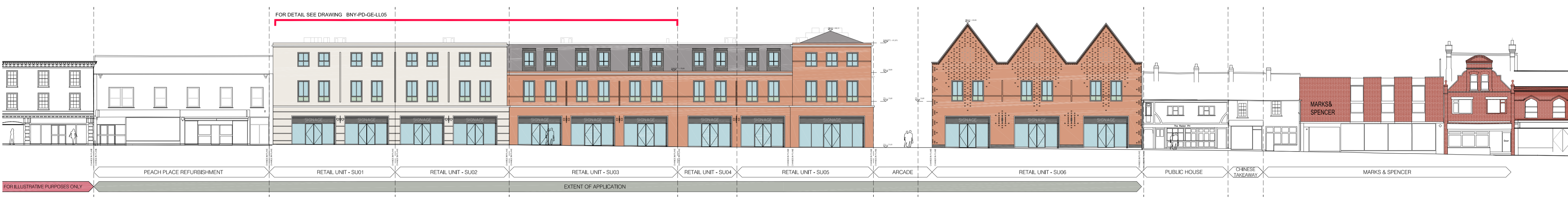
ELEVATION B-B, PEACH STREET [SCALE 1:200 @ A1]