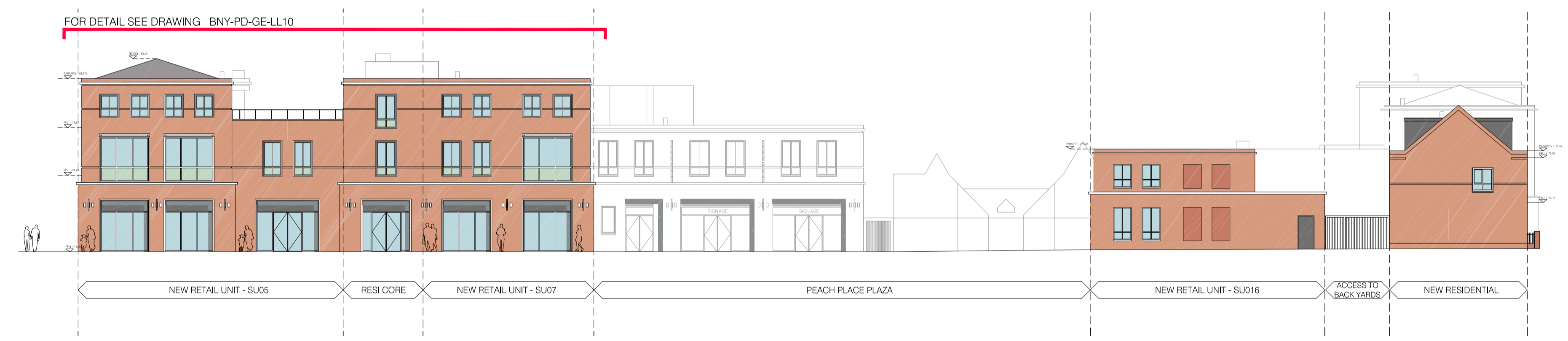
ELEVATION H-H, ARCADE [SCALE 1:200 @ A1]