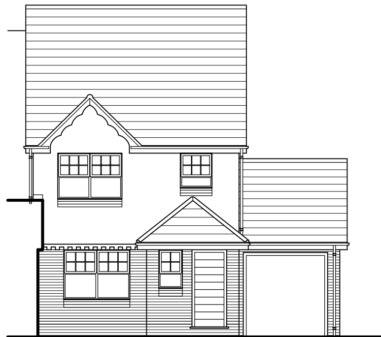
88 EXISTING FRONT ELEVATION

ALL MATERIALS INTENDED TO BE USED ON NEW EXTENSION ARE TO MATCH EXISTING. THIS DRAWING HAS BEEN PREPARED WITHOUT THE BENEFIT OF AN ACCURATE SITE SURVEY REMAINING (SIDE) ELEVATION IS UNAFFECTED BY PROPOSED NEW EXTENSION