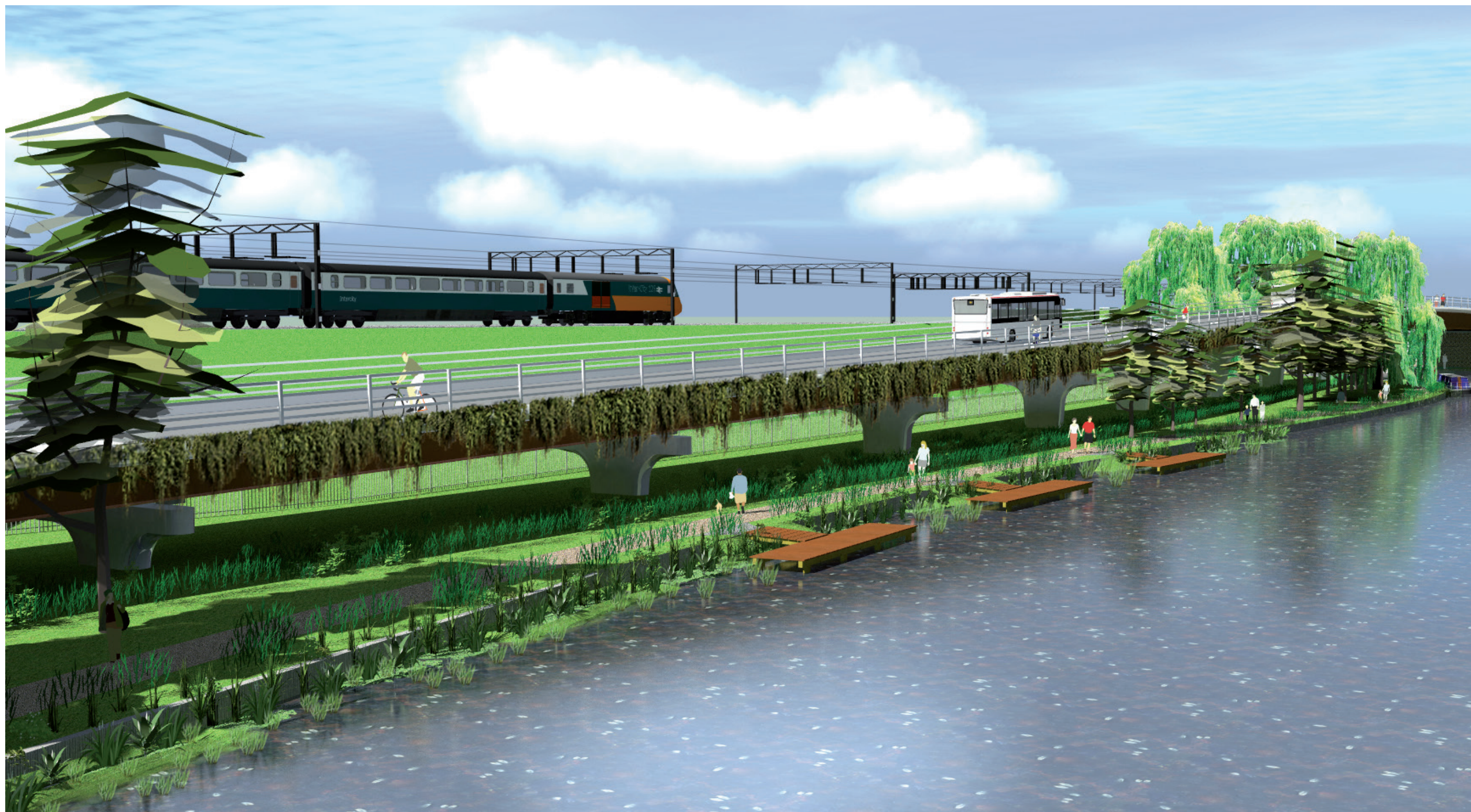
Figure 8. Artist's impression of the view from the River Thames to the south west, towards the proposed new bridge over the Kennet