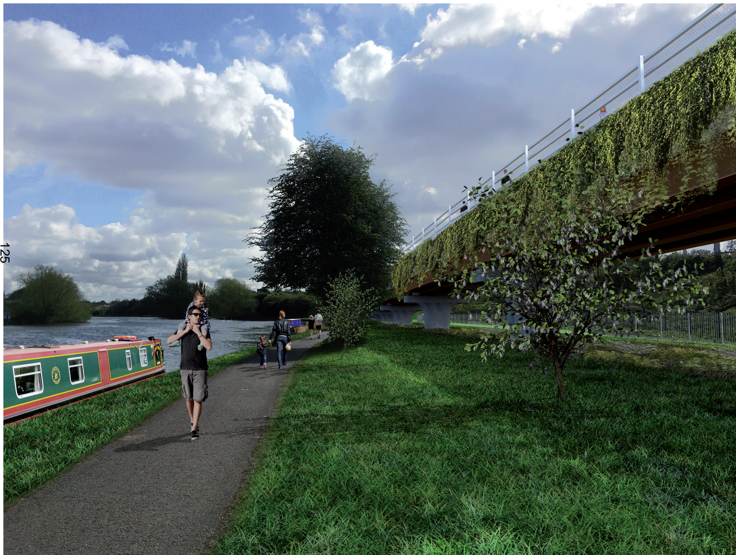
Figure 2. Photomontage of the proposed view from the towpath looking east