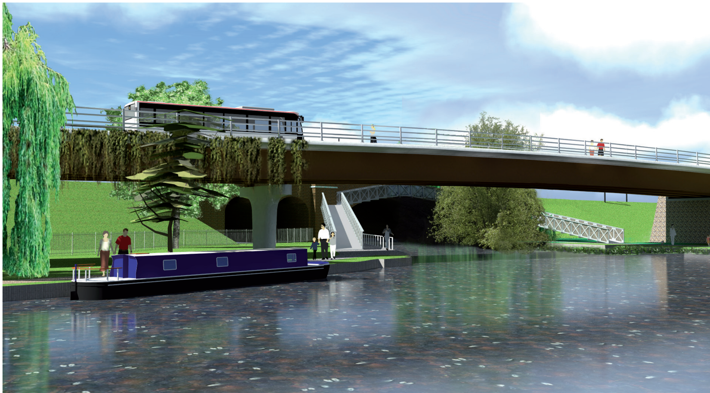
Figure 6. Artist's impression of the view from the River Thames towards the new bridge, looking south.